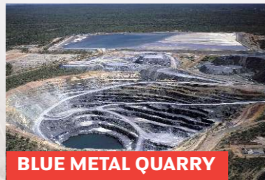
BLUE METAL QUARRY